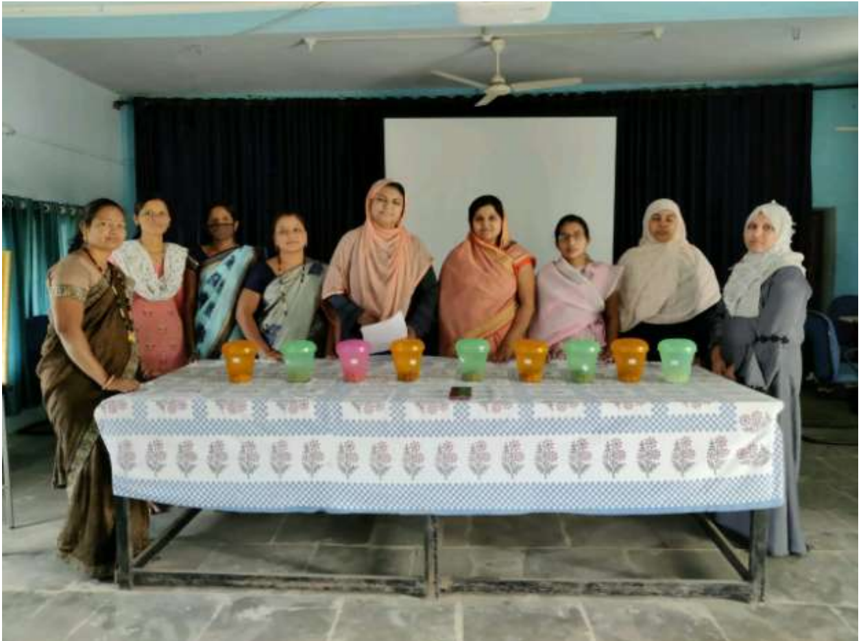
Celebrating send up of smart cooking workshop